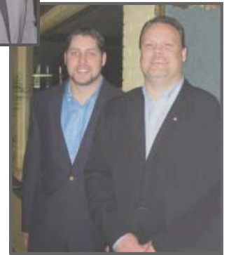
~~~~ Above NATIONAL HEALTH ADMINISTRATORS ~~~~