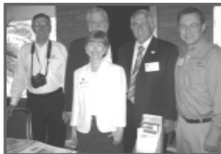
~~~~ Above AARP Staff ~~~~