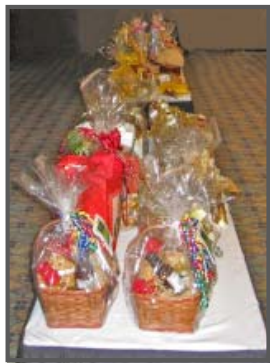
Miles of door prizes donated by locals all across the state!