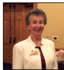
Thanks to Debby Murrell for all the great photos taken during Fall Workshops!